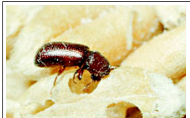
actual size = 1/8 inch (3 mm) long

9. The insect shown above can damage wood. TRUE or FALSE?